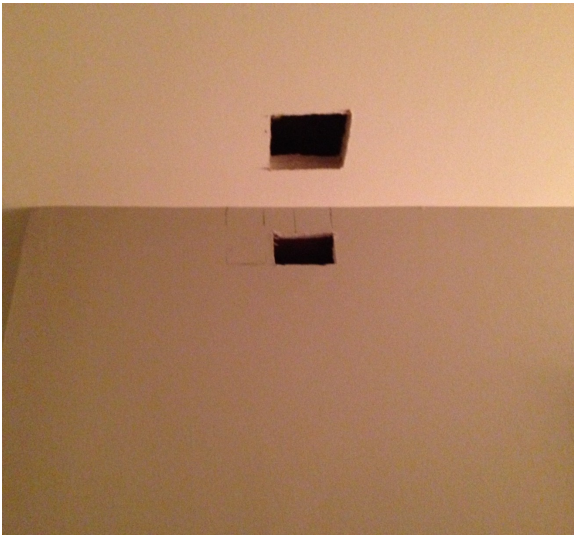
Drywall patch work (Before)

It's that easy!!! The CLRC serves businesses and homeowners who need help with just about any home remodel or maintenance project.