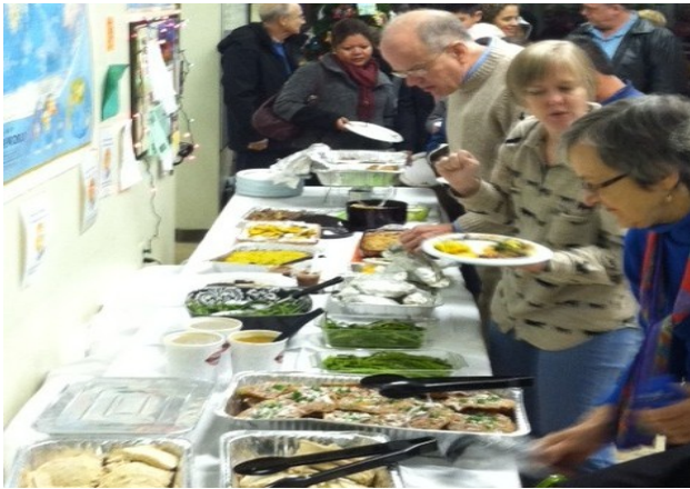
Thanksgiving 2013 Spread