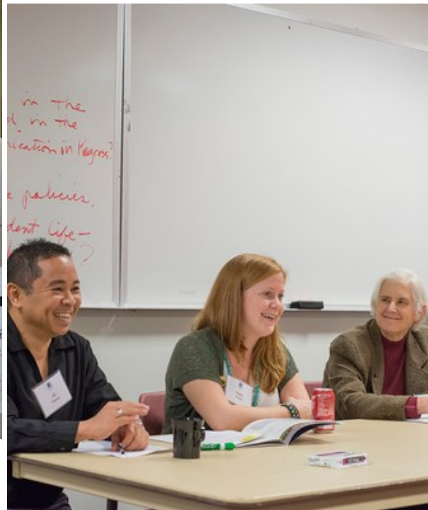
Participating at GMU