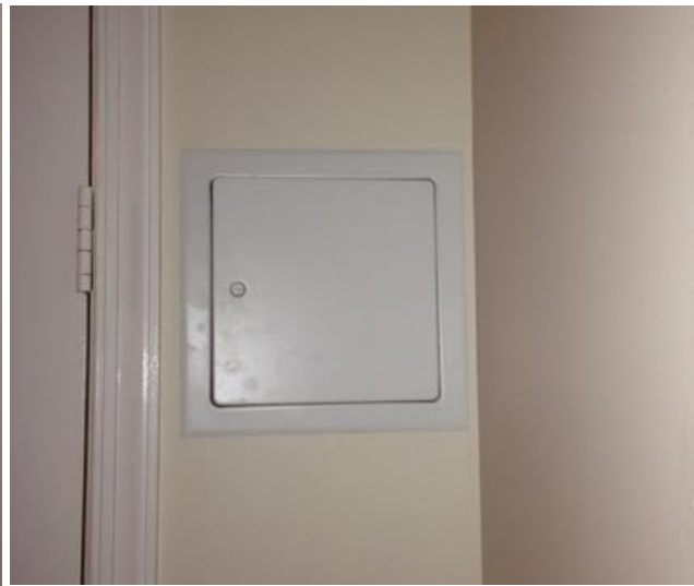
Shutoff valve access door install

Available only at CLRC: GARDEN BOXES for raised beds or cold frames